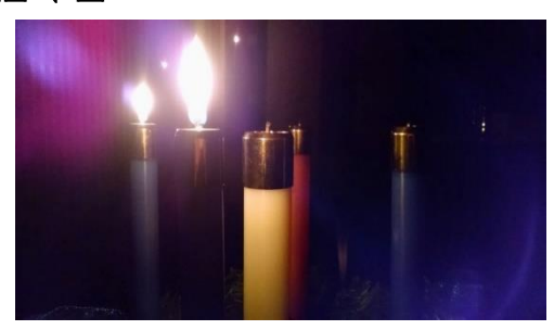
Sundays, November 28, December 5, 12, and 19, 2021