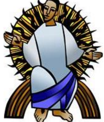
Sunday, November 22, 2020

On this final Sunday of the church year we gather to celebrate the reign of Christ and his victory over death, yet we await the consummation of all things yet to come. Acknowledging Christ as our merciful ruler, we go forth that his reign may be known in our loving words and deeds.