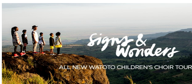
Watoto's excitement from past concerts