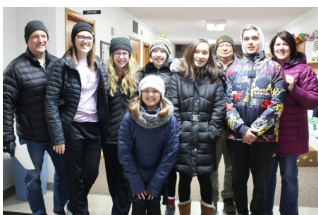
ILC's Christmas Carolers

See you at worship on Wednesday, January 1st at 6 pm!!