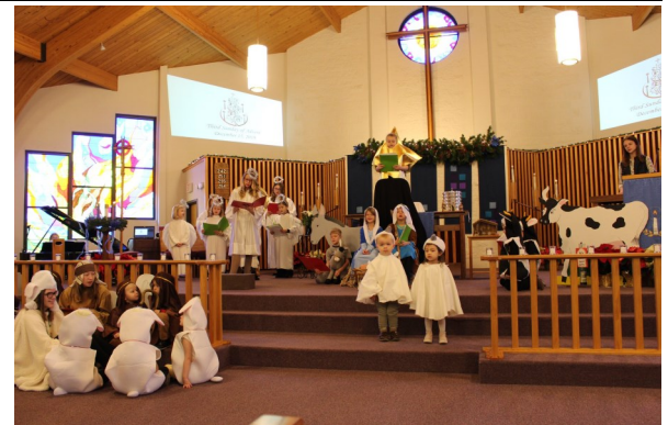
Children's Christmas Program